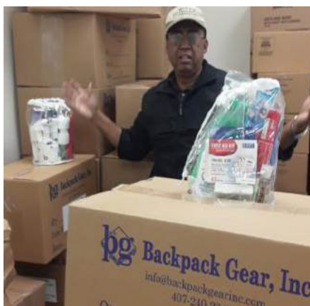
Delivery of the hygiene kits with One Love, One Community

Healthier Glades successfully completed the first year of implementing the Mini Grant initiative in the Glades community. Because of the health pandemic, Healthier Glades supported our mini grantees by giving them the flexibility to adjust the original intent of the grant so that they can implement their project. For many of our grantees, they had to adjust their project from being in-person to either virtual or hybrid. The mini grants allowed Healthier Glades to use this platform as a way to empower residents to utilize resources (like mini grants) to make a community impact. We were able to see a lot of creativity come from our mini grant awardees to implement their projects. Here are some pictures from some of our mini grant awardees: