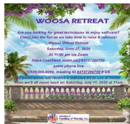
Woosa Caregivers Retreat virtual event flyer