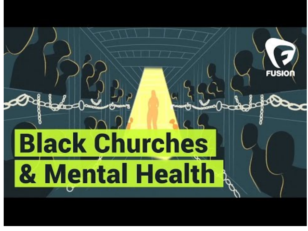
Watch Video At: https://youtu.be/G5dxqgps-Xs

Statistically, a member of the clergy is the <u>number-one place</u> people go when they seek help for mental illness. So for mental health problems, church leaders are first responders —consciously or unconsciously. Yet many pastors feel underequipped to respond. [2]